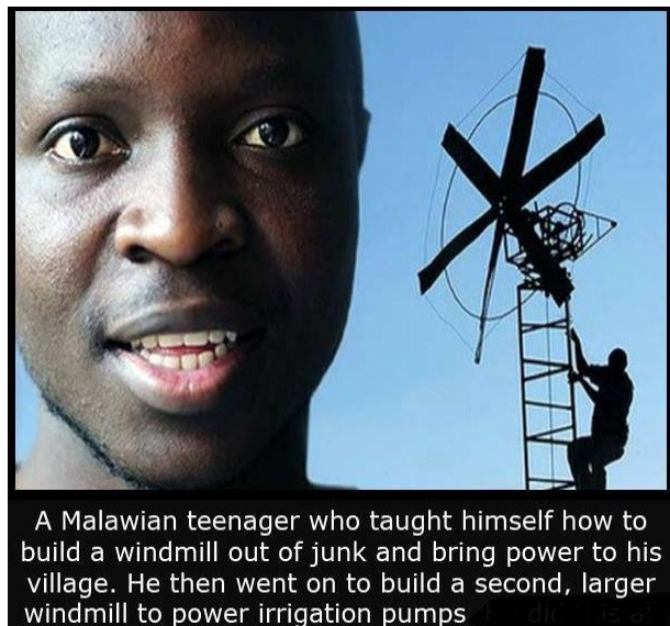
A Malawian teenager who taught himself how to build a windmill out of junk and bring power to his village. He then went on to build a second, larger windmill to power irrigation pumps