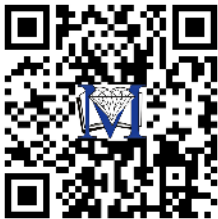
Scan for Friends Website

Lifetime members are honored with an engraved leaf on the "GIVING TREE" in the Library.