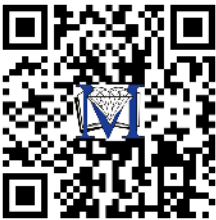
Scan for Friends Website

Lifetime members are honored with an engraved leaf on the "GIVING TREE" in the Library.