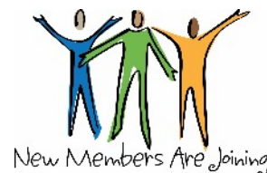
New Members Are Joining

A reminder - Renewal season is upon us! MAY - JUNE - JULY. Each year our annual members must renew. We appreciate your support. Our membership dues help support the various programs at the Murrieta Library for children of all ages, for teen programs, and for adult programs, as well. Our fees are still unchanged: