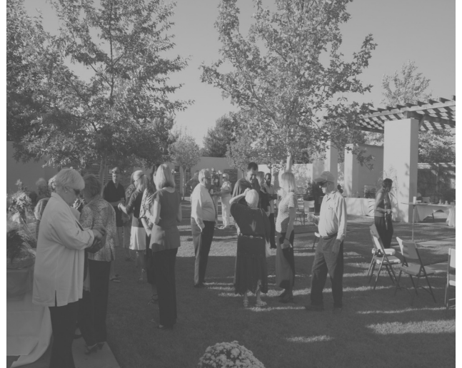
The guests enjoying the Garden of Verses