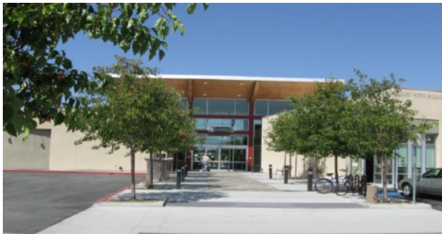
The Murrieta Public Library

Friends of the Murrieta Library looks forward to continuing support of the Library collection and programs, especially the children's summer reading programs, through operation of its bookstores and other fundraising activities. We are proud to be active partners in this vibrant community resource, the Murrieta Public Library.