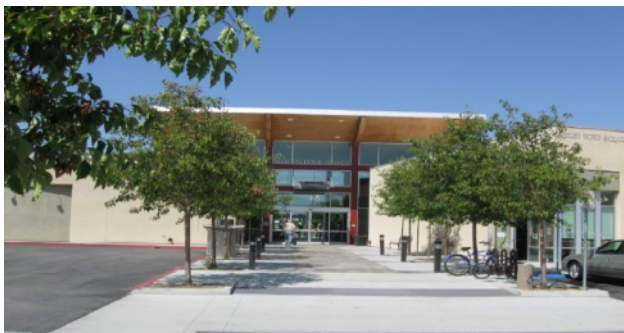
The Murrieta Public Library

Friends of the Murrieta Library looks forward to continuing to support the Library collection and programs, especially the children's summer reading programs, through operation of its bookstores and other fundraising activities. We are proud to be active partners in this vibrant community resource, the Murrieta Public Library.